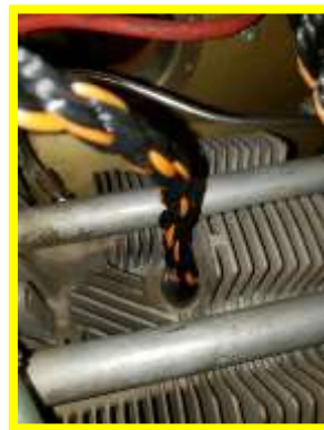
Rope in the cylinder