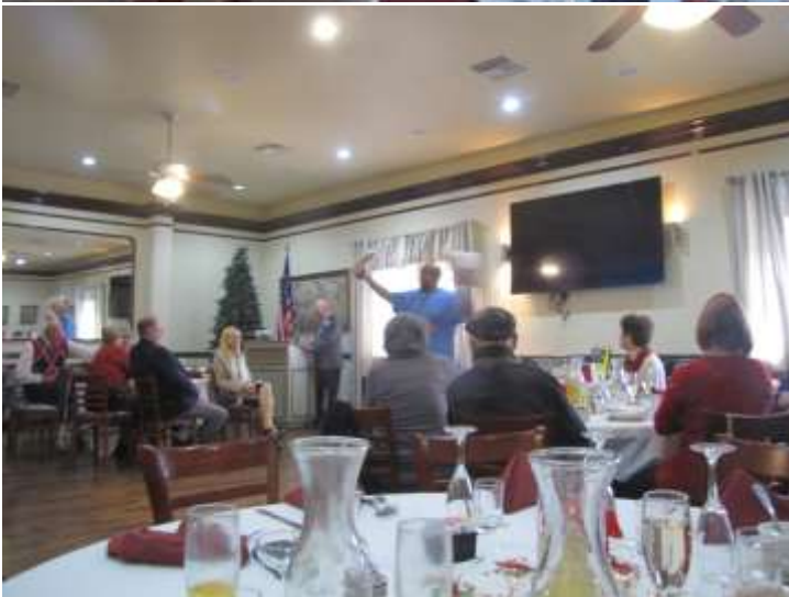
We had a great auction, raising money for youth programs.