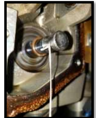
Success! Valve in a reamed guide.